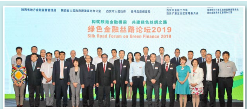
Representatives of Forum's organisers, executive organisers, co-organisers and supporting organisations, guest speakers, HKQAA Governing Council members and special guests. 论坛主办、承办、协办及支持单位代表、演讲嘉宾、本局董事局成员及贵宾合照。